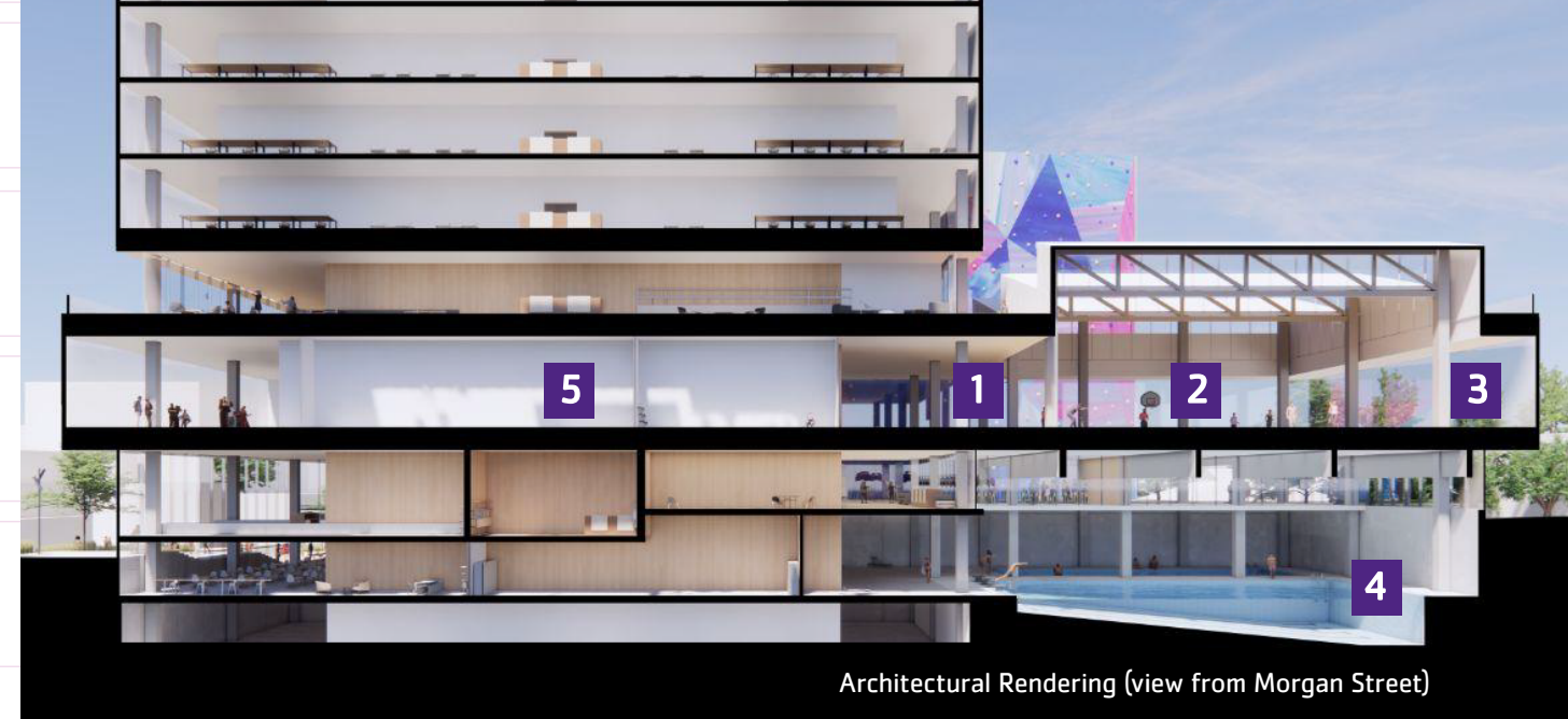
Architectural Rendering (view from Morgan Street)

73% of children using the HELPS literacy curriculum in the Y ACADEMIC SUPPORT PROGRAMS MET OR EXCEEDED 2020 GRADE-LEVEL LITERACY STANDARDS.